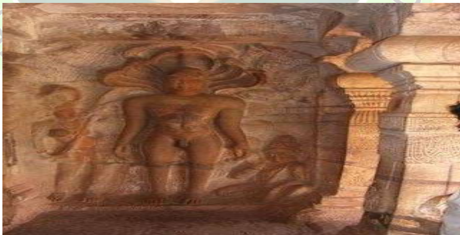
Picture No. 5, Lord Parshvanath, Badami Cave No. 4

1.1.4 Cave No. 4- This cave temple is dedicated to Lord Mahavira , the 24th Tirthankara of Jainism, and is considered the newest among the four caves. There is scholarly debate regarding its construction period; while some believe it was built in the 7th century , others suggest it was constructed in the 8th century , approximately 100 years after the first three caves. The temple houses a statue of Lord Mahavira in a seated posture as its central feature. Additionally, it includes sculptures of Bahubali , Yakshas , and Yakshis . The inner walls and pillars are adorned with numerous intricately carved statues of Jain Tirthankaras , showcasing the temple's rich Jain artistic heritage. (Refer to Picture No. 5)