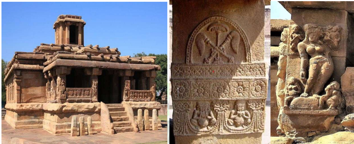
Picture No. -6,7,8 Ladkhan temple, Aihole 600 AD

1.2.2 Durga Temple- The Durga Temple in Aihole, dedicated to Surya (the Sun God) , is believed to have been constructed in the 8th century . 7 This temple is an exceptional example of early Chalukya structural temple architecture and is renowned for its grandeur and intricacy.