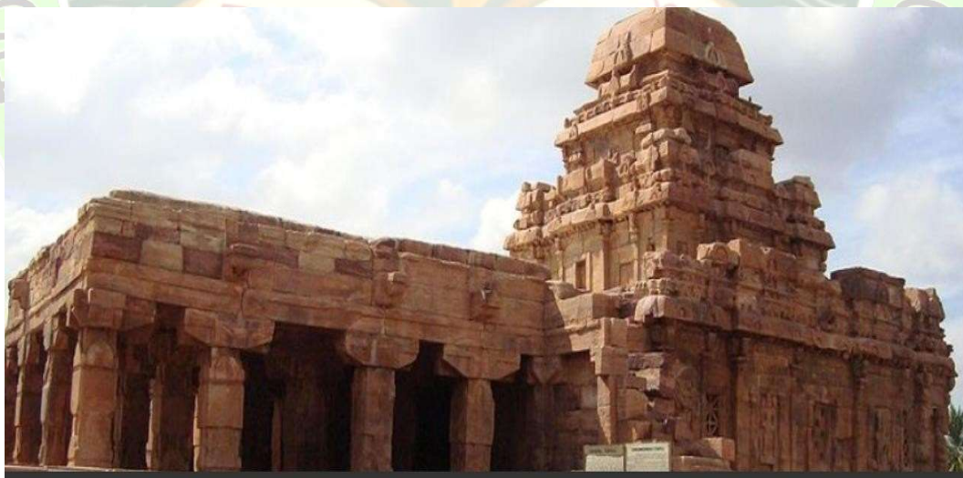
Picture No.12, Sangameswara Temple, Pattadakal, c. 733 AD.

The Sangameswara Temple stands as a testament to the Chalukyas' mastery of Dravidian architecture, blending functional design with artistic brilliance.