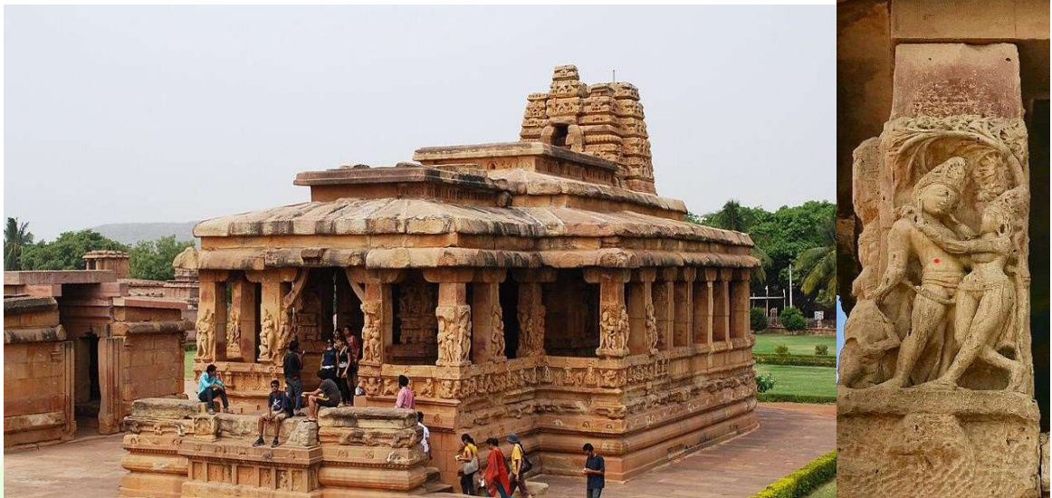
Picture No. 9,10 Durga Temple, Aihole 8th century

sanctorum includes beautiful depictions of stories related to deities, religious themes, and various scenes of spiritual significance. ( Refer to Picture No. 11 ) The Durga Temple is a masterpiece of early Chalukya art and architecture, reflecting their innovative spirit and devotion to integrating artistic traditions into temple design.