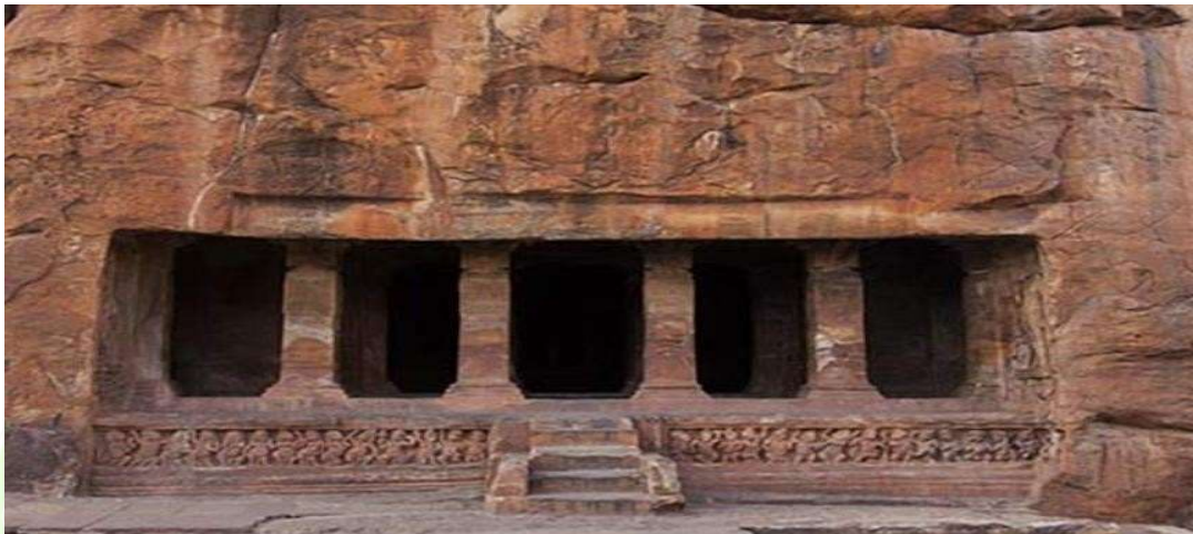
Picture No.1, Badami Caves, Karnataka

commemorate the installation of Vishnu's idol, he donated a village to the temples. The Badami cave complex consists of four temples: Cave Temple No. 1 is dedicated to Shiva. Cave Temples No. 2 and No. 3 are dedicated to Vishnu. Cave Temple No. 4 is a Jain temple. (Refer to Picture No. 1)