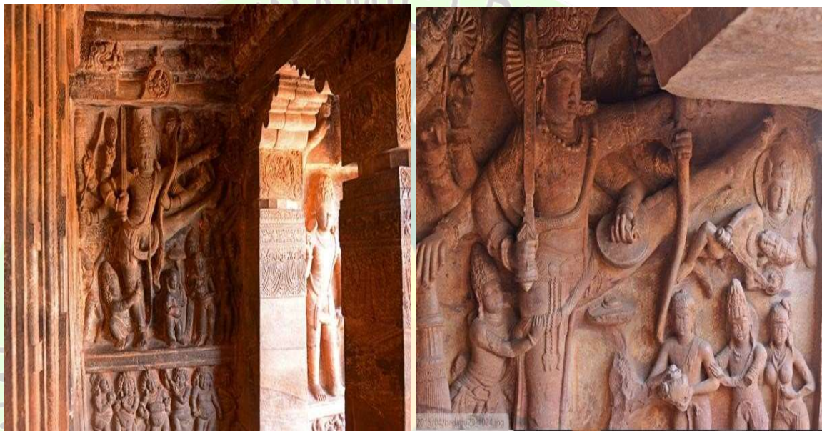
Picture No. 3, Trivikram (Vamanavatar) incarnation, Badami cave no. 2

The temple is supported by four intricately carved pillars, each adorned with fine and detailed carvings, reflecting the artistic excellence of the Chalukya artisans.