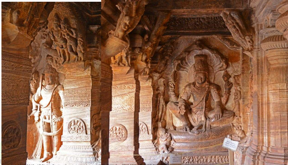
Picture No. -4, Vishnu on Sheshnag, Badami cave number 3

1.1.4 Cave No. 4- This cave temple is dedicated to Lord Mahavira , the 24th Tirthankara of Jainism, and is considered the newest among the four caves. There is scholarly debate regarding its construction period; while some believe it was built in the 7th century , others suggest it was constructed in the 8th century , approximately 100 years after the first three caves. The temple houses a statue of Lord Mahavira in a seated posture as its central feature. Additionally, it includes sculptures of Bahubali , Yakshas , and Yakshis . The inner walls and pillars are adorned with numerous intricately carved statues of Jain Tirthankaras , showcasing the temple's rich Jain artistic heritage. (Refer to Picture No. 5)